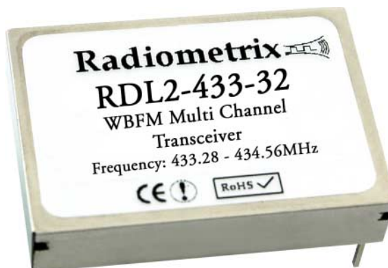
Figure 1: RDL2-433-32

This makes the RDL2 ideally suited to those low power applications where low cost multi-channel operation is required.